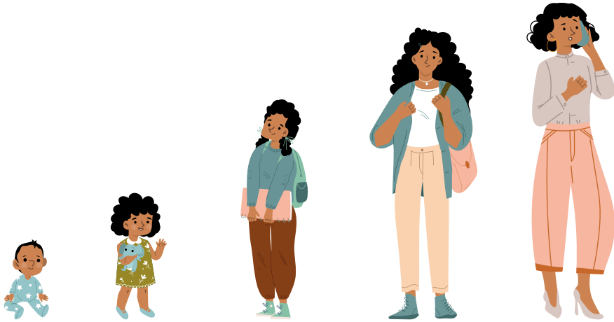
baby toddler child teenager adult